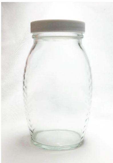
Queenline Style Jar