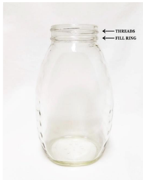
Classic Style Jar